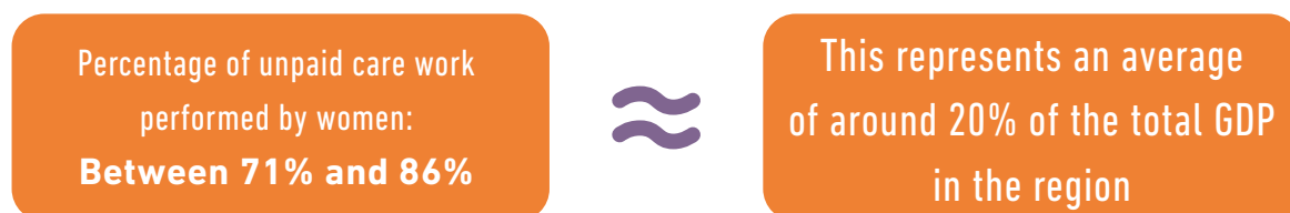
Figure prepared by the CIM and EUROsociAL+ project team when creating this document.

The pandemic has widened the gaps and structural inequalities linked to economic rights and the unequal distribution of care work, thereby hurting the employment and working conditions of women in Latin America and the Caribbean, setting back the advances that had been achieved in terms of labor force participation by more than a decade.