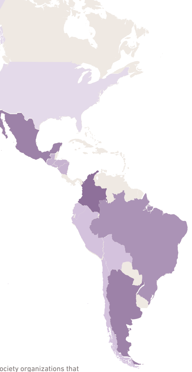
Illustration 2. Geographic distribution and concentration of civil society organizations that we have identified in Latin America and the Caribbean, from the mapping of actors. With technology of Bing. © Australian Bureau of Statistics, GeoNames, Microsoft, Navinfo, TomTom, Wikipedia

research. The most recurrent issues have to do with conflict resolution, the defense of human rights, strengthening democracy, and research applied to designing and evaluating public policies. This group includes, in particular, the presence of Germany's political party foundations (especially the Friedrich Ebert Stiftung/FES and the Heinrich Böll Stiftung), which have some country offices and are key agents for dissemination, discussion, and the strategic positioning of items for the civil society agenda. FES, for example, has promoted a wide-ranging regional program called "FES-minismos" focused on feminist issues that are important for each office, but tied to the purpose of giving impetus to human rights and a gender perspective. Also of special note are certain regional networks that become involved in human rights through religious charisma, for example Diakonia (of the Swedish churches) and Podión (sponsored by Catholic and Protestant churches