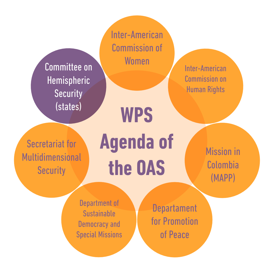
Illustration 3: The WPS agenda of the OAS.

In these processes the Organization of American States (OAS) and its various offices and mechanisms, both internal and multilateral, have a fundamental role to play, beginning with the commitment to a broader conceptualization and greater articulation implied in the Declaration on Security in the Americas (2003). This expanded and holistic vision of security establishes a foundation for a process of dialogue and coordination among actors both internal to and from outside the Organization.