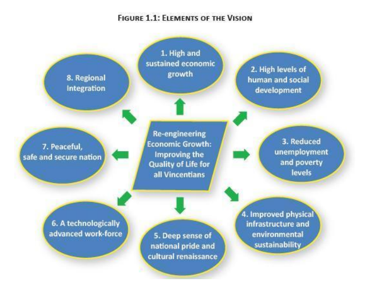
Source: National Economic and Social Development Plan 2013 – 2025 Page 16

In that regard, the NESDP 2013 – 2025 focuses on five (5) strategic objectives and corresponding strategies whose final aim is the realization of a comprehensive and sustainable country development. These objectives and strategies are, as follows: