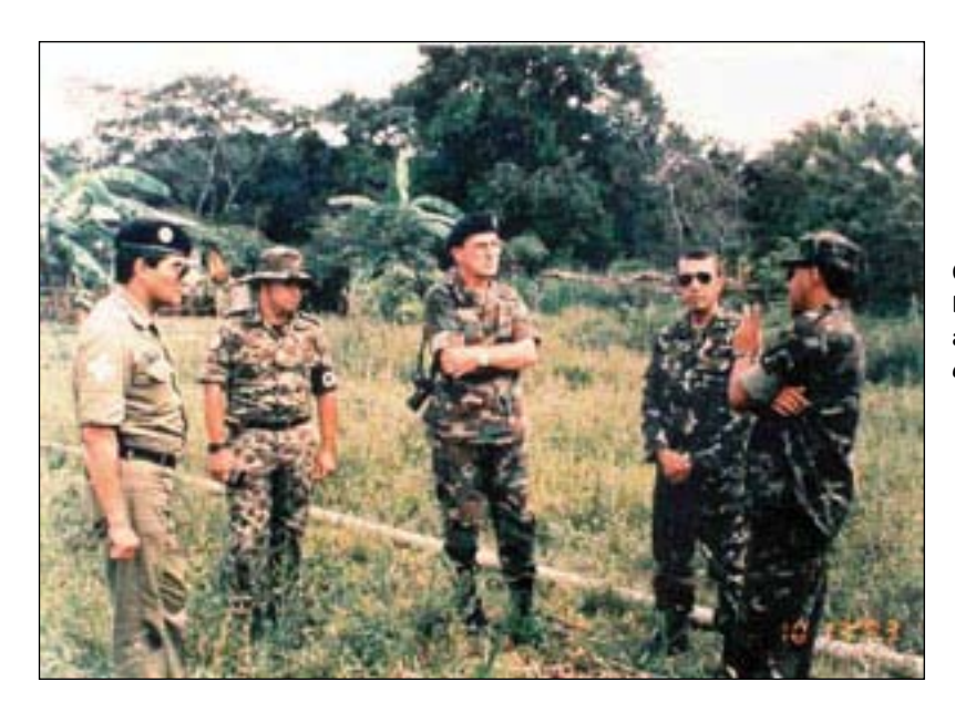
Officers from the Inter-American Defense Board during a 1991 visit to Nicaragua to assess the mine problem.

affected nation in the region, its staff also studied the landmine problem in Costa Rica, El Salvador, Guatemala and Honduras, all of which had seen the use of anti-personnel mines to some extent throughout the 1980s and had requested similar assistance.